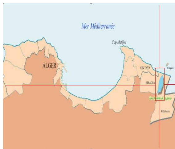
Figure 1. Localization of the wetland of Réghaïa

7. Oued El-Biar: With the mouth of the Oued, stagnation of waste water, the existence of scattered discharges wild on the banks, the release of the nauseous odors. It is necessary to announce that the waste water comes from the Industrial Park while forwarding by the agricultural land of the communes of Rouiba, Réghaïa and Heuraoua and flows directly in the lake.