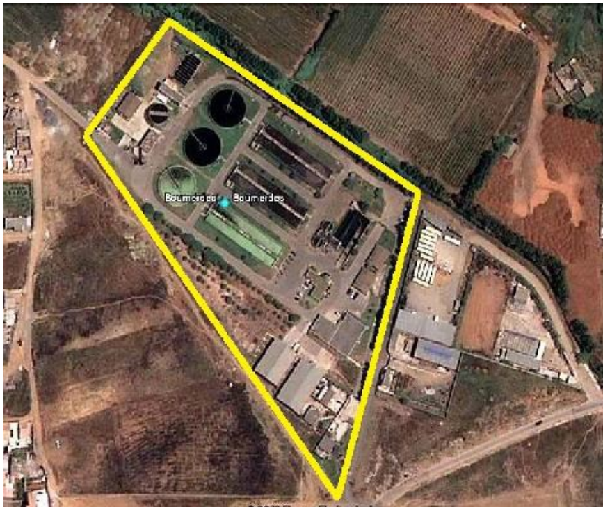
Figure 1: Situation of the boumerdes station

In order to avoid the problems of data collection, we chose to apply LCA on an existing wastewater treatment plant, it is a fairly recent station based on activated sludge treatment. With a capacity of 75000 Eq/Hab. Wastewater arriving at the station is pre-treated (screening, degreasing, grit removal) and then sent for biological treatment. Biological treatment is carried out in activated sludge tanks equipped with a bridging system. This arrangement ensures the treatment of organic pollution. The extracted sludge is thickened by flotation and then stored and packaged in a maturation tarpaulin.